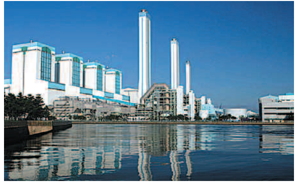
Wet FGD system at Tangjin Power Station, Korea

Lodge Cottrell is able to offer FGD technology for large process applications such as power stations, steel works, and chemical plants. This high efficiency, low cost, limestone to gypsum process is well proven and is operational on many large boiler units worldwide.